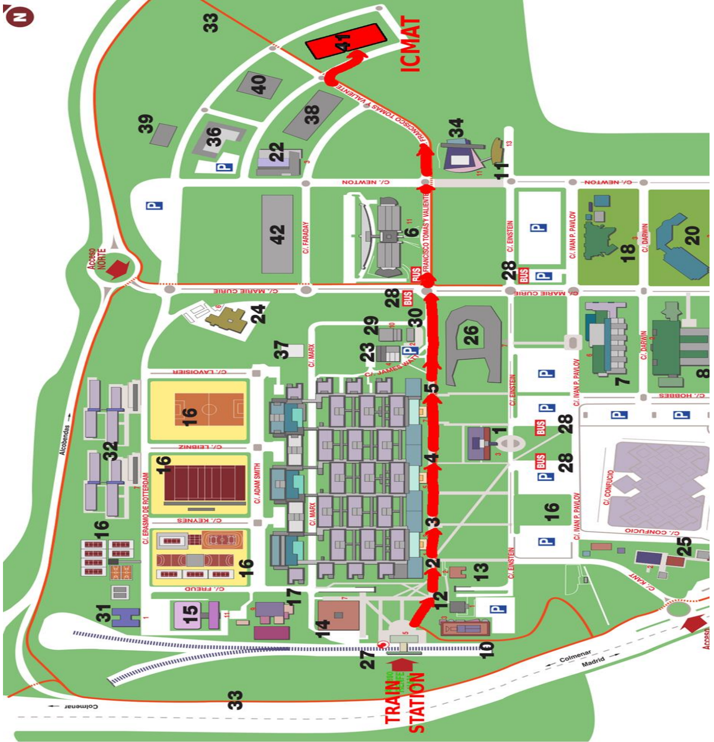
Fig 2. From the train station Cantoblanco Universidad to ICMAT.

Francisco Tomás y Valiente Street. Follow the arrows from the train station to ICMAT in the map in Fig. 2 – ICMAT is at the end of this street just on the intersection with 13-15 Nicolás Cabrera Street.