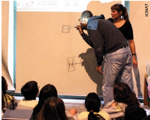
Secondary school students participated in the Week of MPE13.

and a wall on which the public could try out their efforts completed the exhibition.