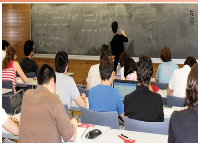
In the JAESchool of Mathematics, organized every year by the ICMAT, undergraduate students can know the work of researchers.