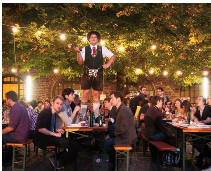
The social program of HLF was full of activities, including a mini Oktoberfest organized for participants.

Around 40 laureates attended this first occasion of the HLF: three Abel prize-winners, seven Fields medalists, three Nevanlinna prize-winners and some thirty recipients