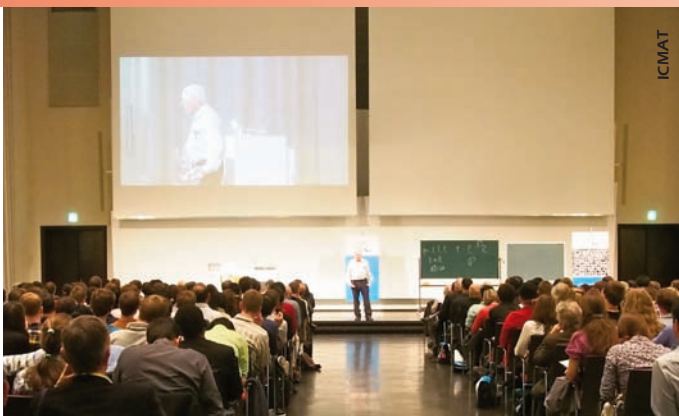
Fields medalist Stephen Smale was one of the speakers at the first HLF.